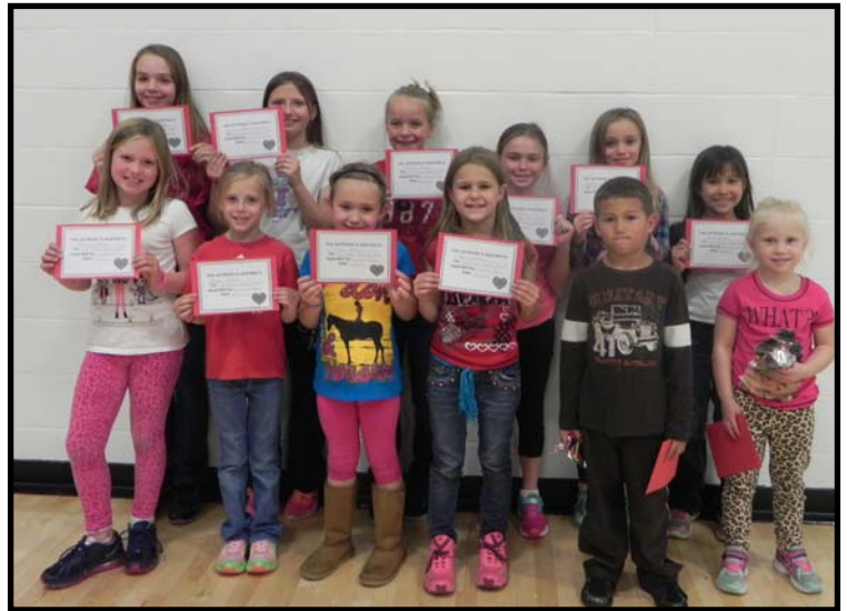
T.A.T.U sponsored a coloring contest for the elementary students, with the winners being featured above.

Drugs and alcohol can cause someone to lose their family and friends or even their life. Be drug free!